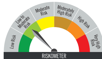
The risk of the scheme is low to moderate

*Investors should consult their financial advisers if in doubt about whether the product is suitable for them.